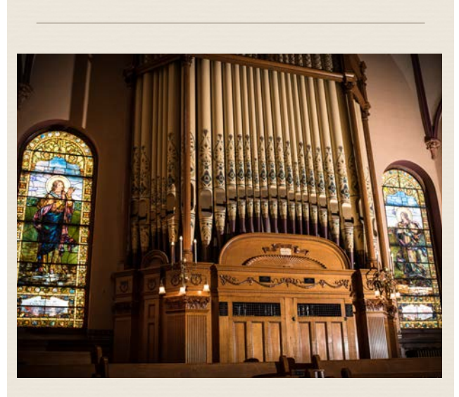
19th Century Pipe Organ